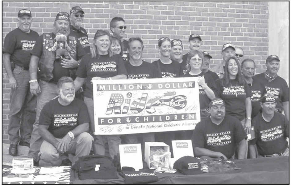
Pictured are riders from last year's "Million Dollar Ride for Children." This year, the ride culminates in Dallas with a two-day event at the West End September 8 and 9.

If you would like more information on the "Million Dollar Ride for Children," log on to www.milliondollarride.org .