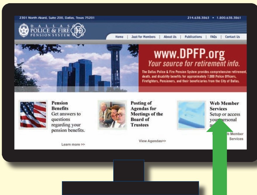
Link to Web Member Services at www.dpfp.org