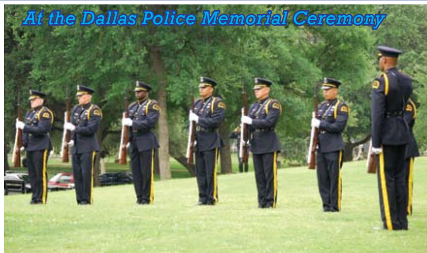
On May 18, the Dallas Police Department honored Officers killed in the line of duty (pictured: The Dallas Police Department Honor Guard)